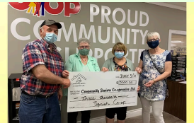
Thank You Tignish Co-op! $3,000 Contribution to CSCL's Fundraising Campaign