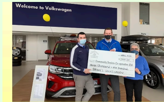
Thank You Brown's Volkswagen! $3,100 Contribution