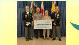
Thank You O'Leary Legion Br. #21! $500 Contribution to CSCL's Fundraising Campaign