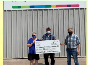
Thank You West Cape Wind Energy! $10,000 Contribution