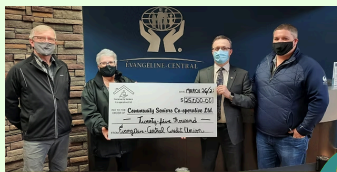
Evangeline-Central Credit Union $25,000 Contribution to CSCL's Capital Campaign